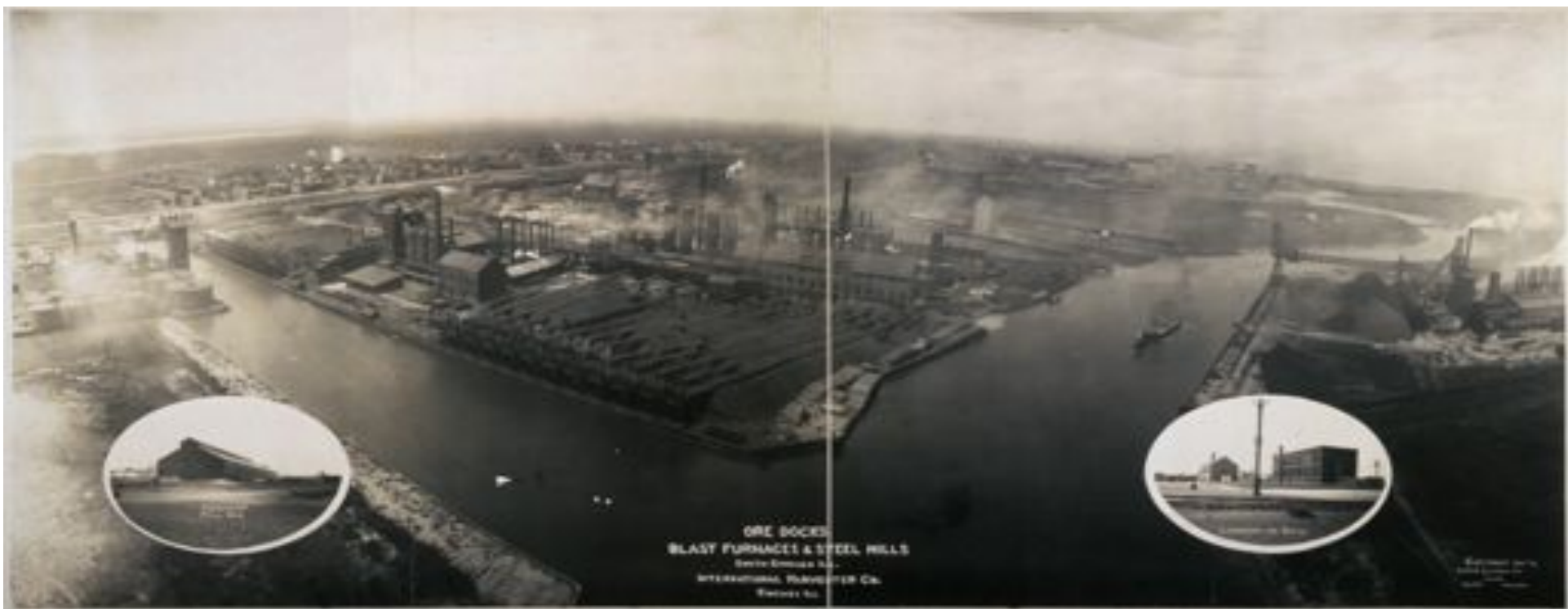
ORE DOCKS BLAST FURNACES & STEEL MILLS DUNFORD, PENN. INTERNATIONAL HARVESTER Co. Pittsburgh, Pa.