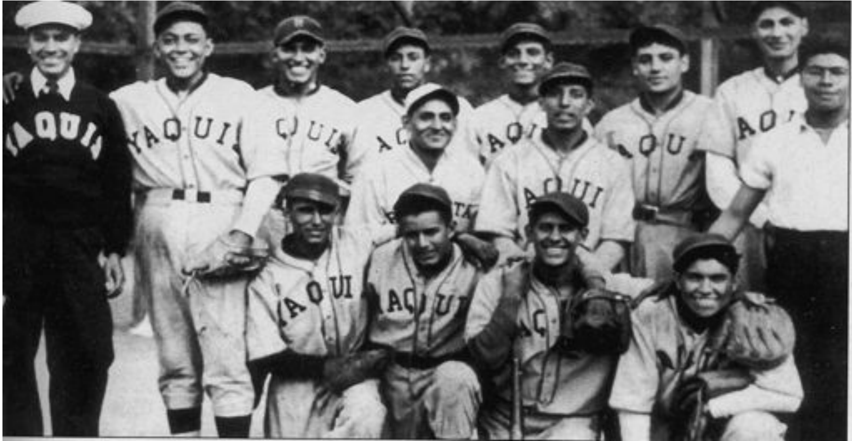
Yaquis Baseball Team South Chicago